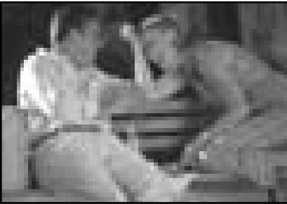
This image is 72 dpi. It looks pixelated.

This is the effect you get when you give us an image from a web page.